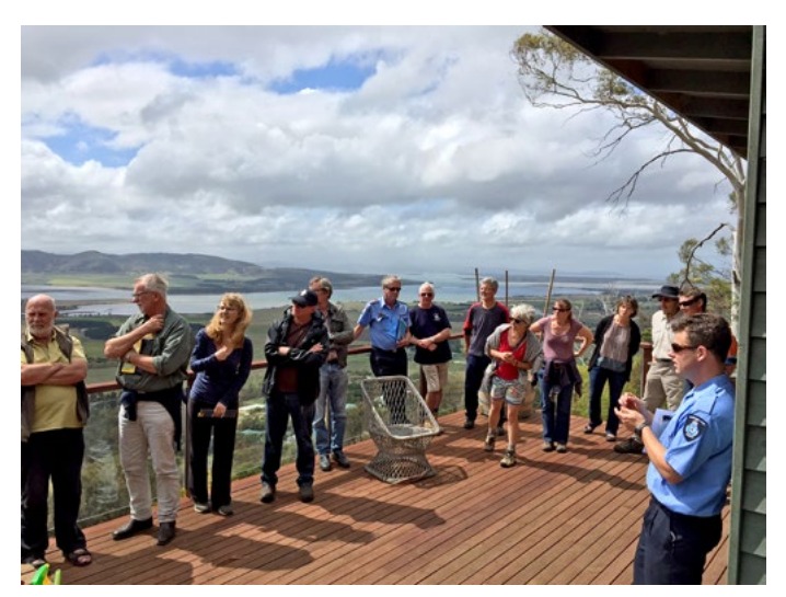
Dulcot Bushfire Ready Property Assessments