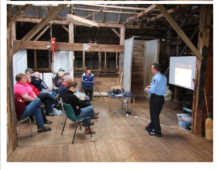
Bushfire Ready Community Forums and Bushfire Ready Workshops on Flinders Island