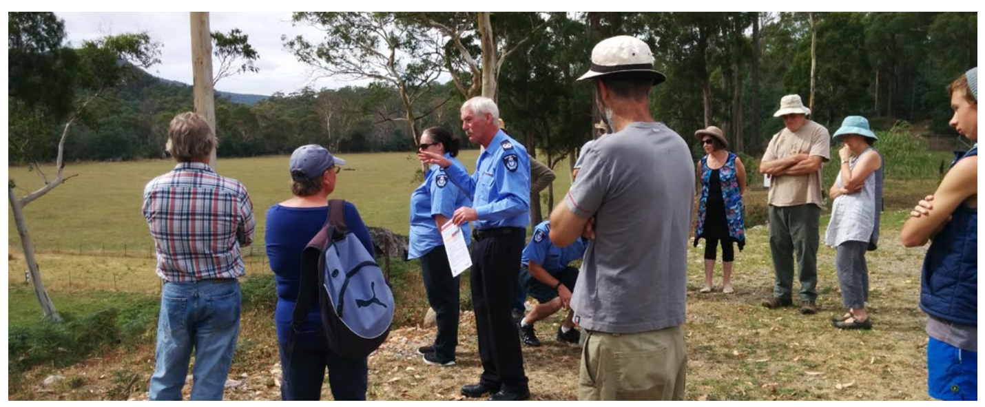
Weegena Bushfire Ready Property Assessments